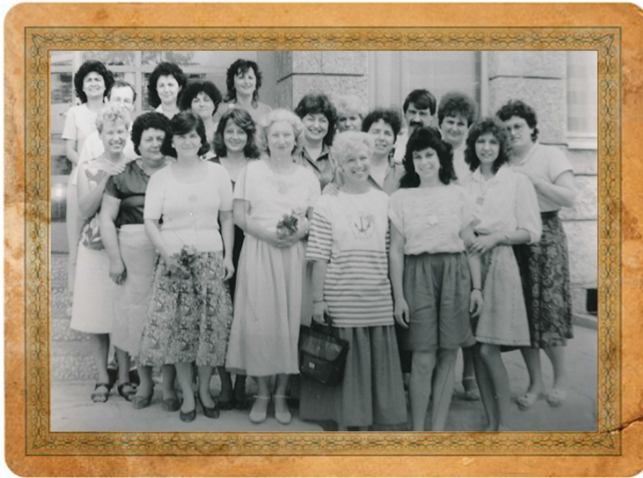
Picture 5. The First Seminar on PPT in Bulgaria 15-19 June 1992 Psychiatric Clinic, Varna

Colleagues enthusiastically attended the seminars to learn about psychodynamic, family therapy, existential, and humanistic therapies and principles and to apply them to themselves and their patients.”