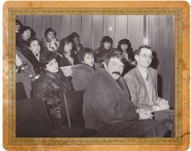
Picture 3. Group photo