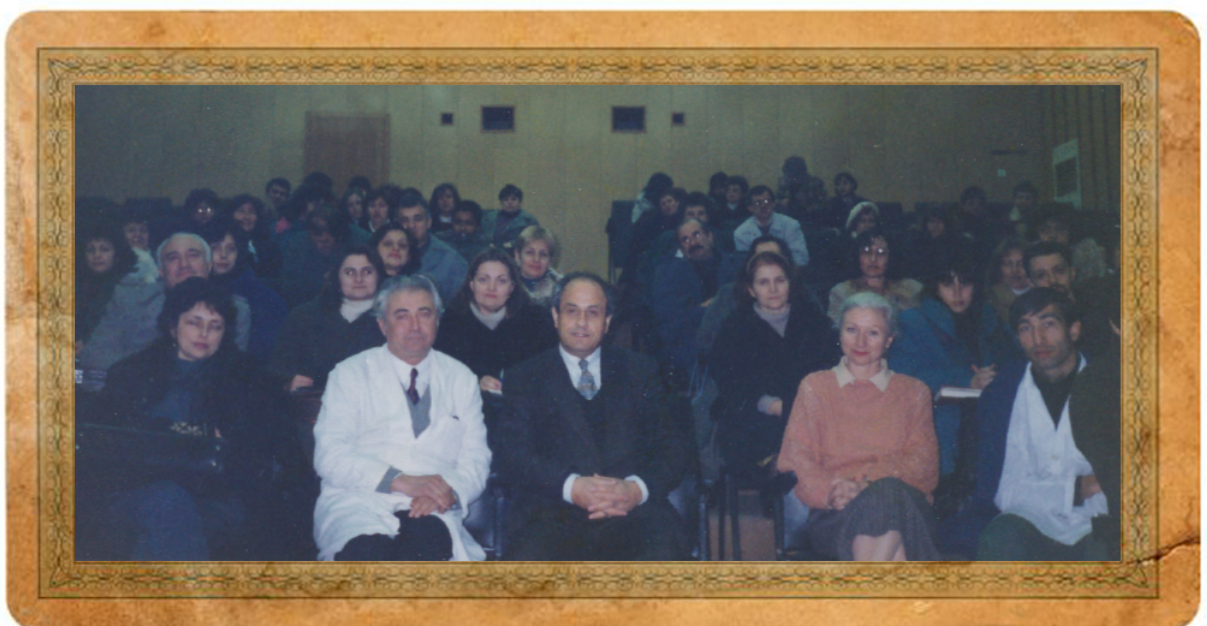
Picture 7. October 1992: The First Seminar on PPT in Sofia with Nossrat Peseschkian