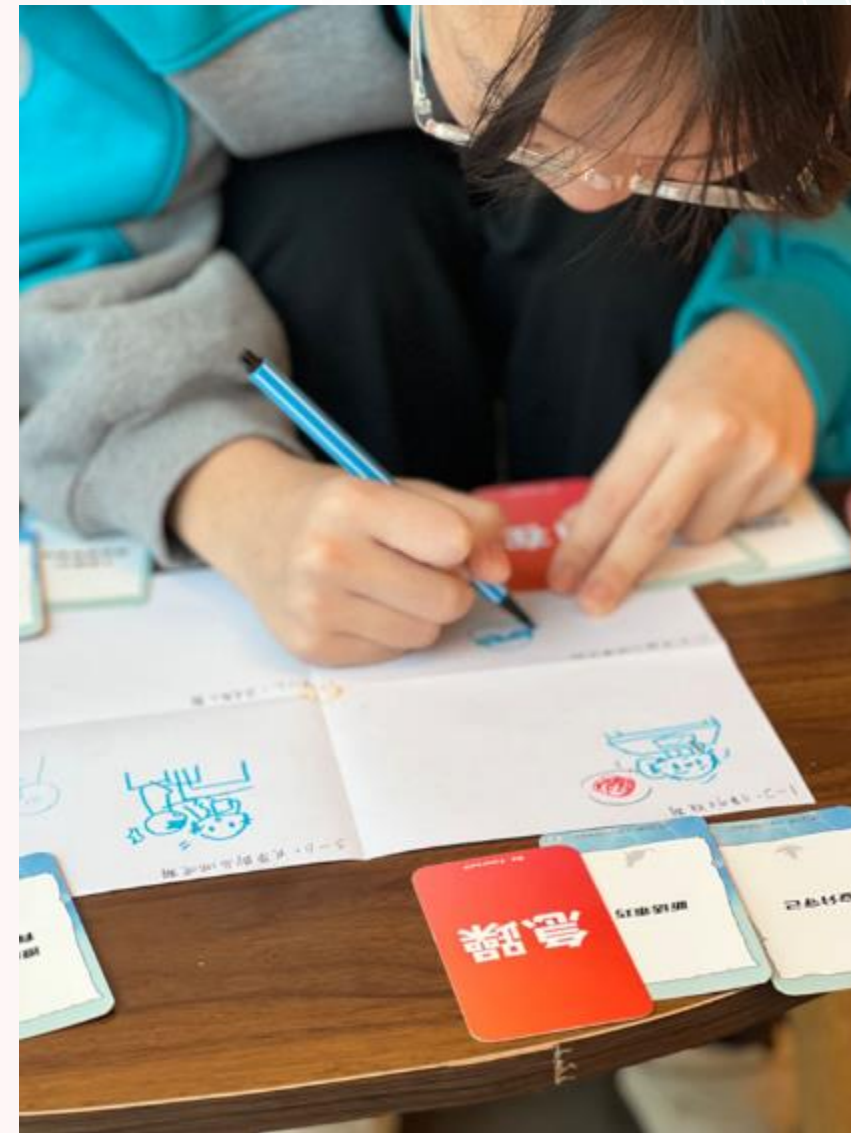
Positive Youth Psychology Cases