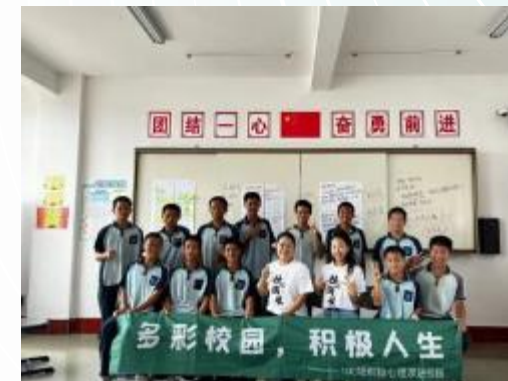
Positive Psychology in Schools