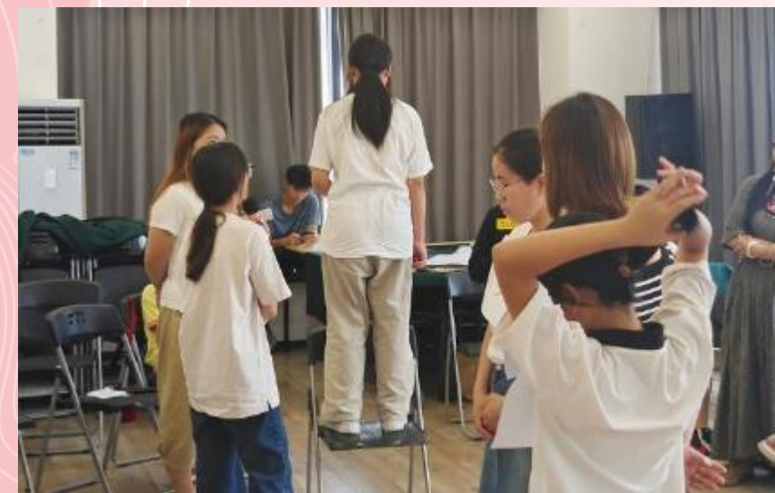
Teen Self-Discovery Groups