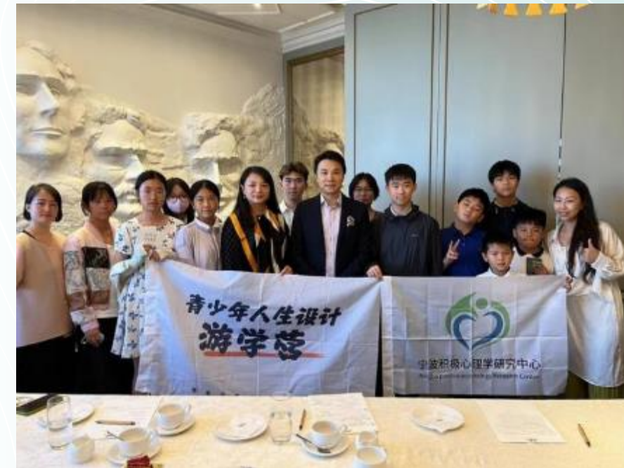
Junior Career Tour