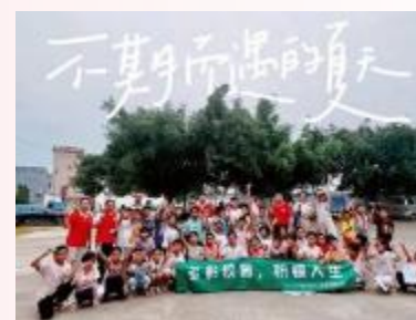
Positive Psychology Public Benefit Village