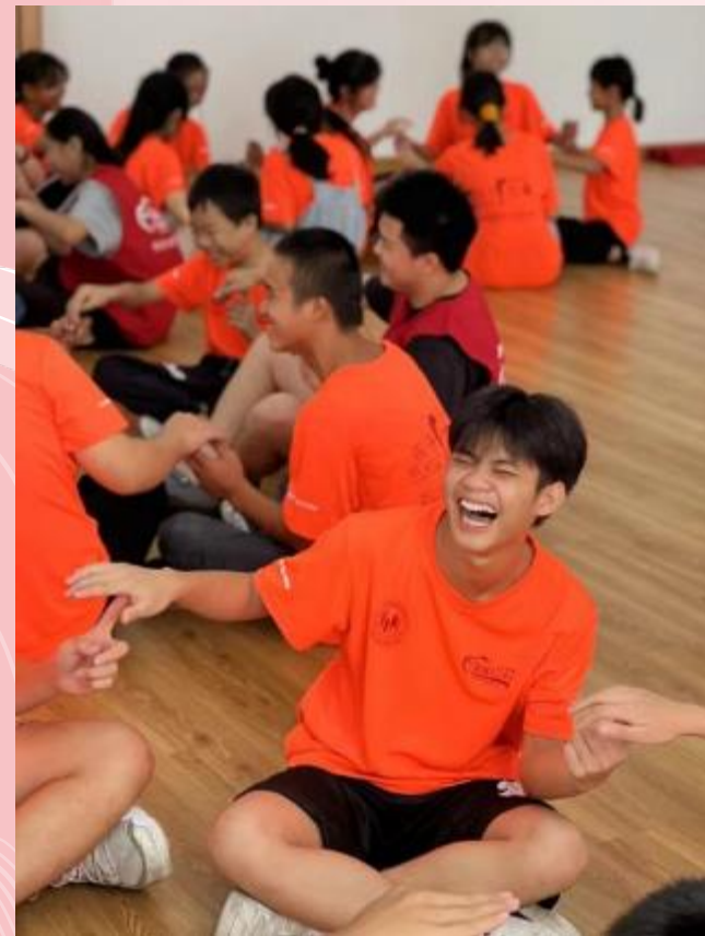
Junior Pi Empowerment Group