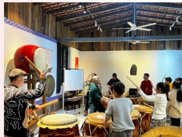
Junior π Physical and Mental Growth Salon