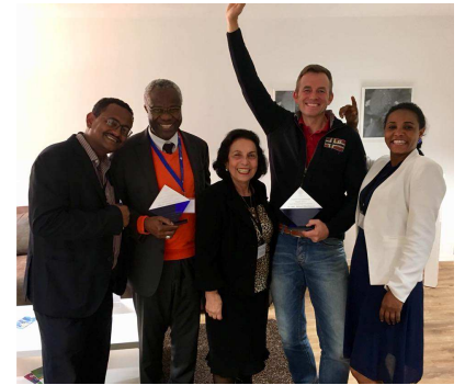
Positive Psychotherapy Award

Congratulations from WAPP and the PPT community!