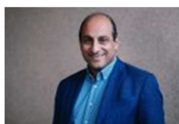
Hamid Peseschkian, Germany